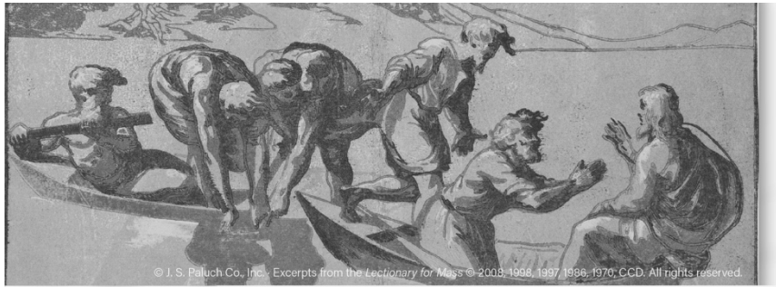
The Miraculous Draught of Fishes c. 1520 Attributed to Ugo da Carpi (Italian, c. 1480–after 1525) after Raffaello Sanzio, called Raphael (Italian, 1483–1520) Art Institute of Chicago

© J. S. Paluch Co., Inc. Excerpts from the Lectionary for Mass © 2003, 1998, 1997, 1986, 1976, CCD. All rights reserved.